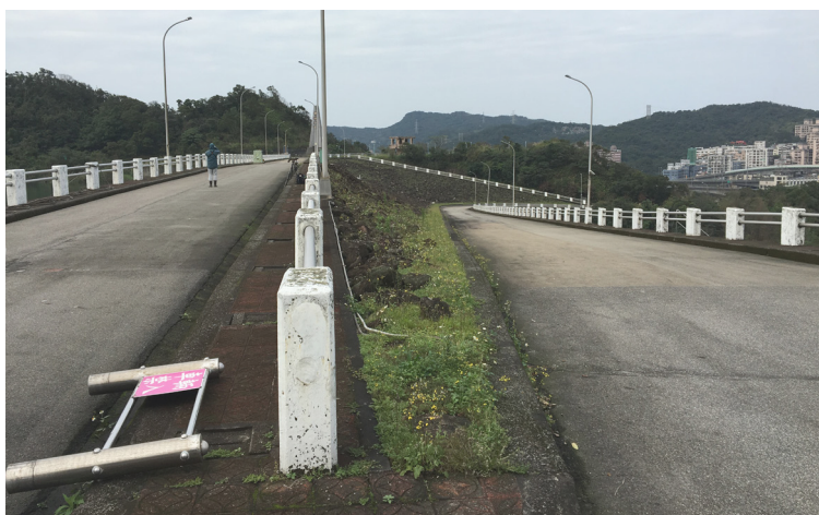
Figure 5. View of the dam from the main entrance of the control center.

Special thanks to Brilliance Instrument & Control Engineering Co Ltd, who allowed us to write this case study.