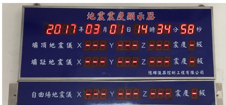
Figure 4. Panel control concerning the seismic monitoring.