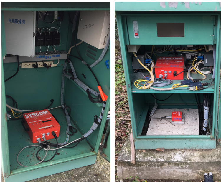
Figure 3. The cabinets for dam top (left) and the free field (right) units.

SYSCOM Instruments SA is a subsidiary of BARTEC GROUP, a multinational manufacturer of industrial safety equipment. SYSCOM Instruments SA is a leading provider of vibration and seismic monitoring equipment for civil engineering and safety related markets, especially for NPP and LNG plants.