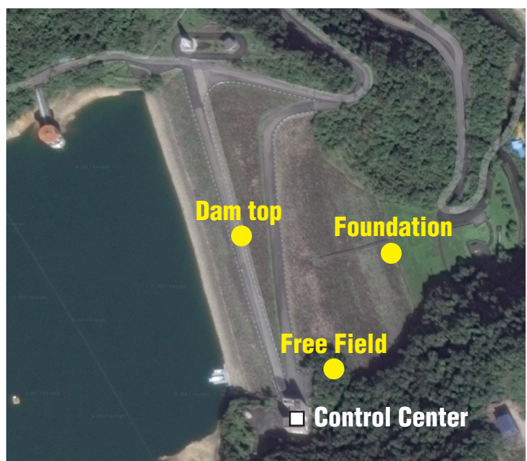
Figure 2. The Hsin-Shan dam with the location of the measurement points.

The different strong motion units are connected to the control center by means of fiber optic cables. The control center is a building located at the dam abutment where the data coming from all the sensors installed on the dam are collected.