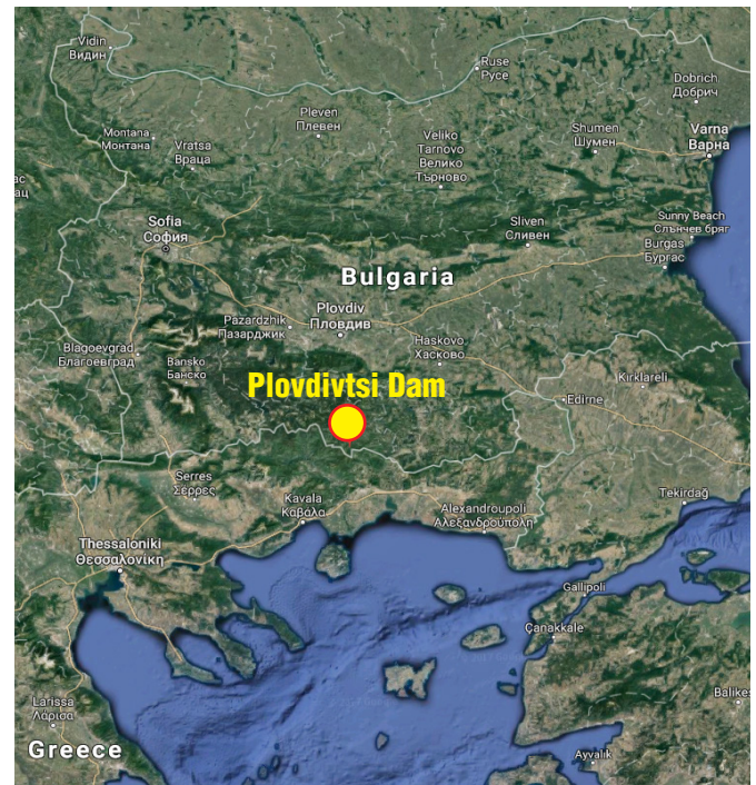
Figure 1. The location of the Plovdivtsi Dam, in the South of Bulgaria.