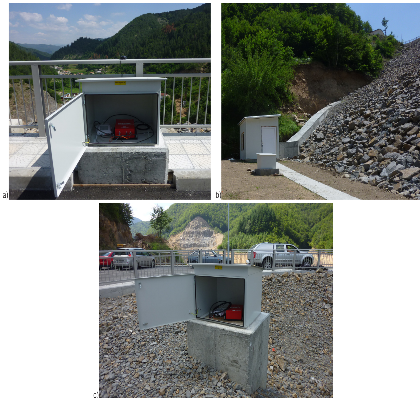
Figure 3. MR3000DMS instruments installed on the Plovdivtshi Dam: A1 (a); A2 (b) and A3 (c).