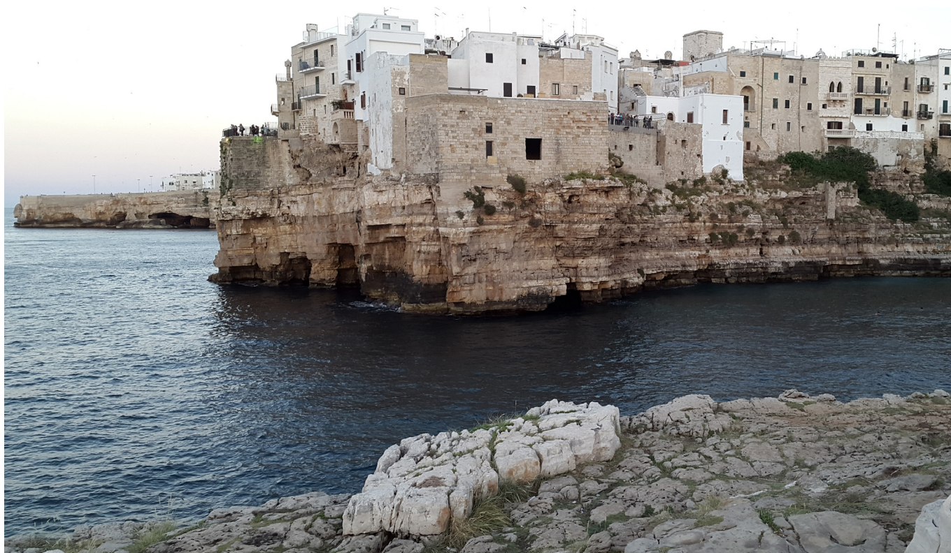
Figure 1. The historical centre of Polignano a Mare.