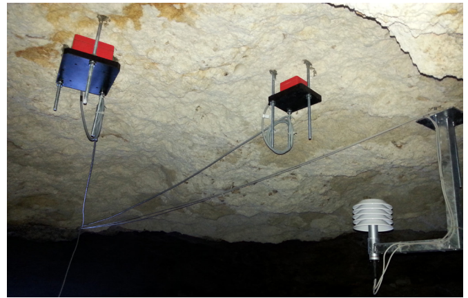
Figure 5. MS01 and MS02 installed in the cave ceiling.

All the MRs record the events exceeding the threshold values, defined a priori based on previous experiences on similar structures. An empiric method is then used to fine adjust these thresholds: during the first month of the monitoring, background data are saved in daily files, in order to measure the structural background noise, to be able to successively define proper trigger and alarm values.