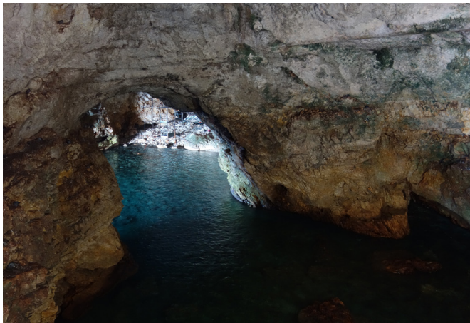
Figure 2. The "Grotta Palazzese" cave.

In the last months, several buildings above the caves have suffered of unexpected vibrations due to small collapses of the caverns. The worse situation was in the "Grotta Palazzese", the most renown of the city (see Figure 2).