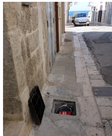
Figure 6. MR04 installed in Via Gelsomino.