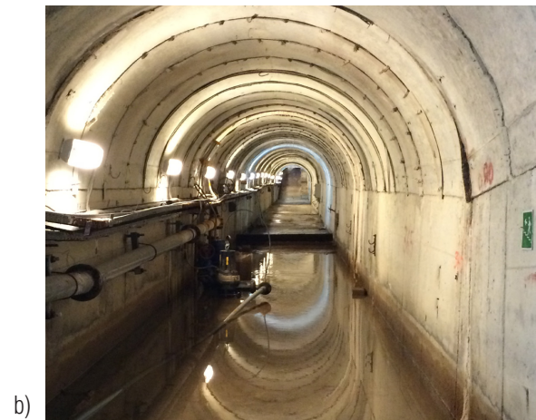
Figure 5. The vertical MR3000DMS at location ER3 (a), installed in the foundation of the Evinos dam, in a service gallery (b).