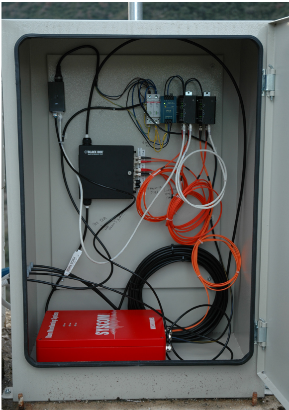
Figure 4. Horizontal mount MR3000DMS at location ER4 in Evinos dam.

Regarding Evinos dam, the control room is located 1.8 km away from the dam and the network access is achieved through point-to-multi-point wireless Ethernet extenders. For this dam, a total fiber optic cable length of more than 2 km is used.