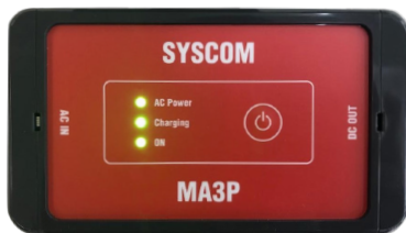
MA3P Top view