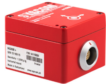
MS2008+ aluminium housing