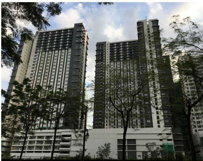
Figure 1. High-rise buildings in Taguig (Philippines). The MR3000SB devices are installed in the building on the left.