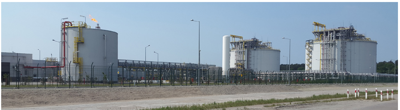
Figure 3. Side view of the plant with the two tanks.