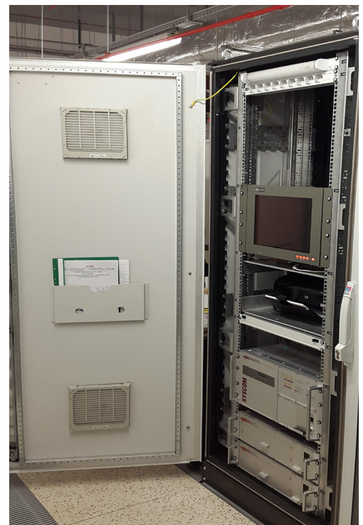
Figure 2. The cabinet in the control room.