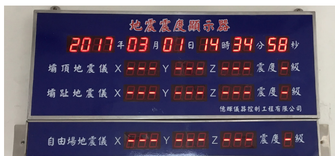
Figure 4. Panel control concerning the seismic monitoring.