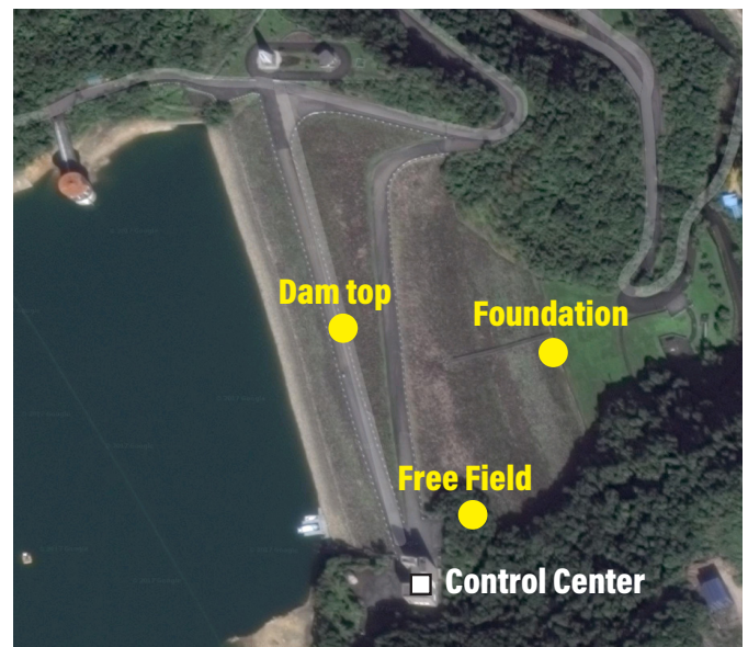
Figure 2. The Hsin-Shan dam with the location of the measurement points.

The different strong motion units are connected to the control center by means of fiber optic cables. The control center is a building located at the dam abutment where the data coming from all the sensors installed on the dam are collected.