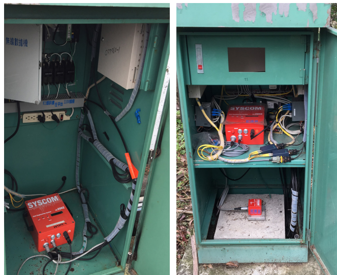
Figure 3. The cabinets for dam top (left) and the free field (right) units.